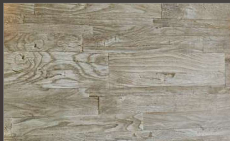
Antique Wood Driftwood Panel™

A low-maintenance alternative, our Antique Wood and Hive products have the lifelike appearance and texture of aged wood and natural stone. This system was designed with quality and durability in mind and is water-resistant, non-warping, non-porous, and non-splintering. We make them from recycled stone that has been mixed with resin, and we build them to last. The Antique wood panels are interlocking for a seamless installation, while the Hive tiles come in concave and convex pairs that will add dimension and excitement to any project.