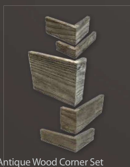
Antique Wood Corner Set