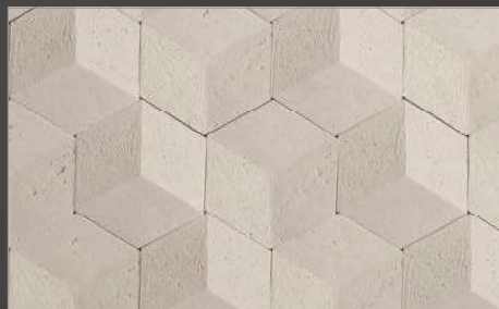
Hive Etched Cream Tile™