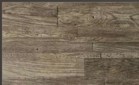
Antique Wood Barnwood Panel™