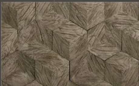
Hive Barnwood Tile™