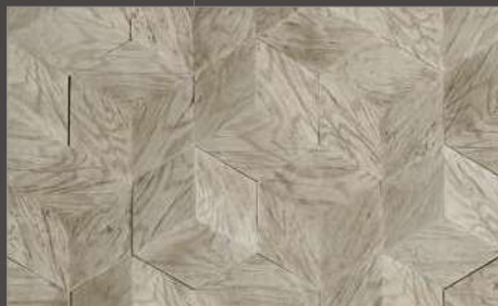
Hive Driftwood Tile™