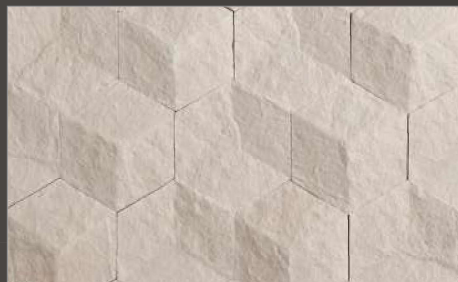
Hive Chiseled Cream Tile™