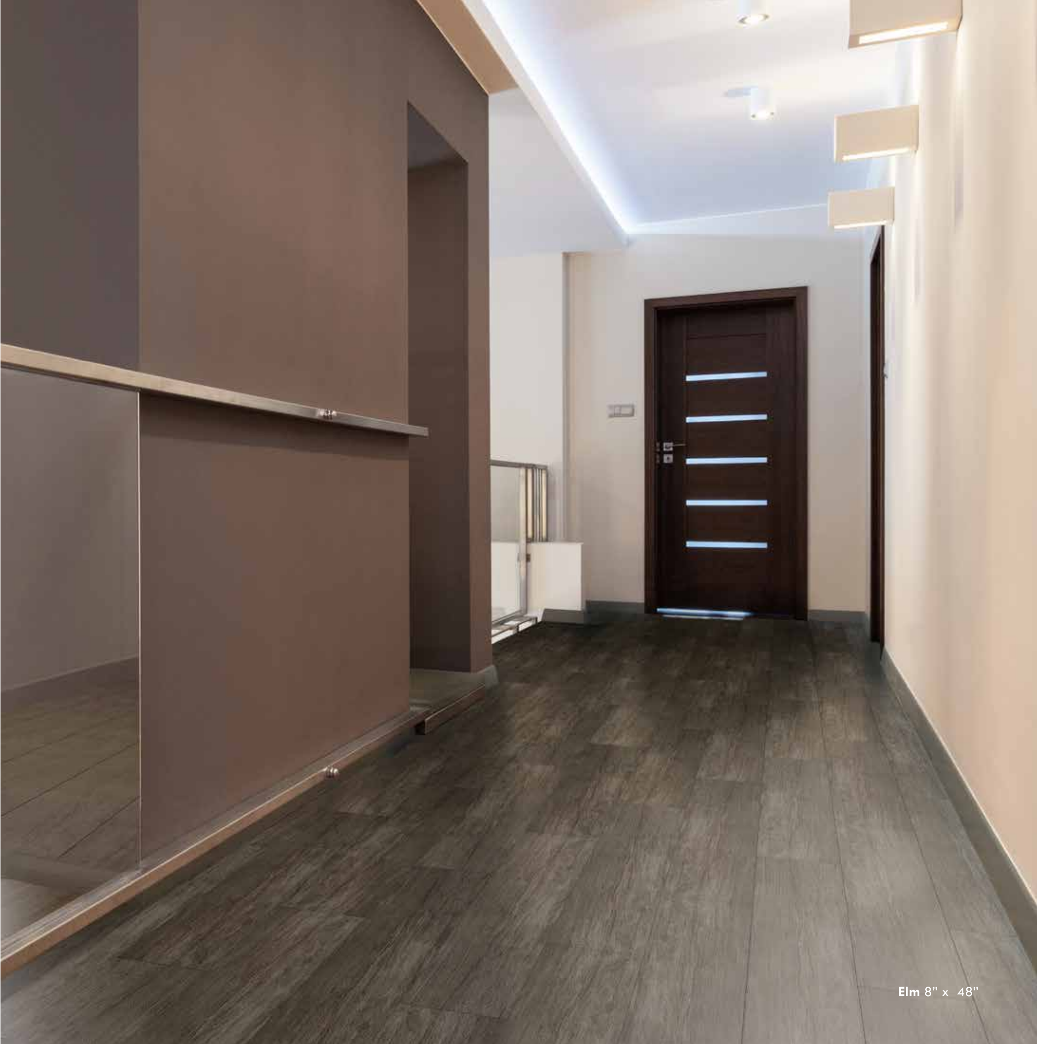
Elm 8" x 48"