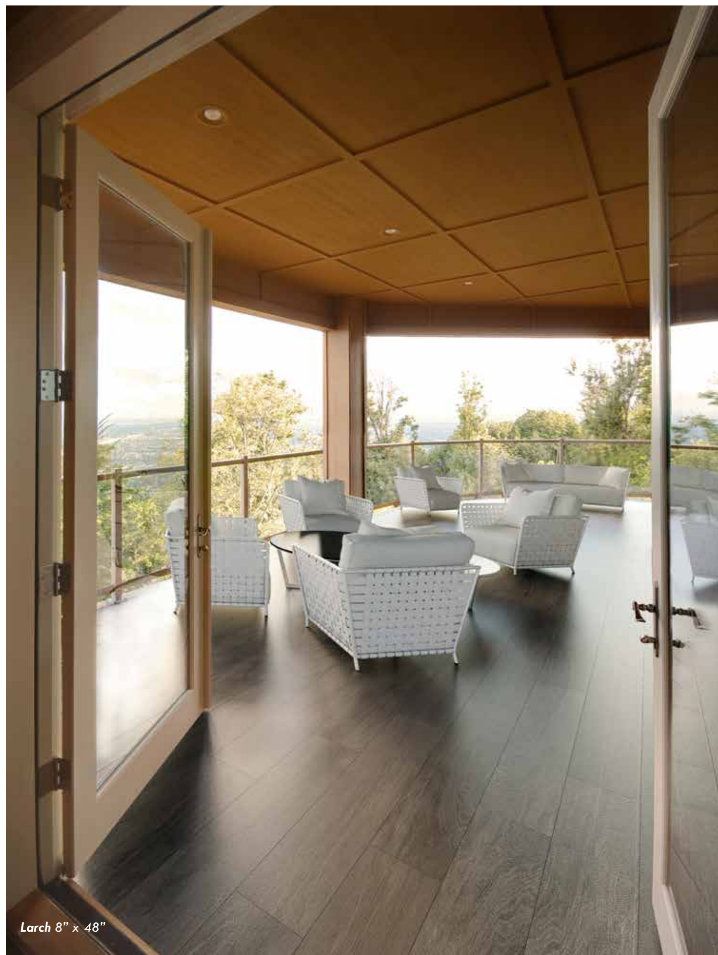
Larch 8" x 48"