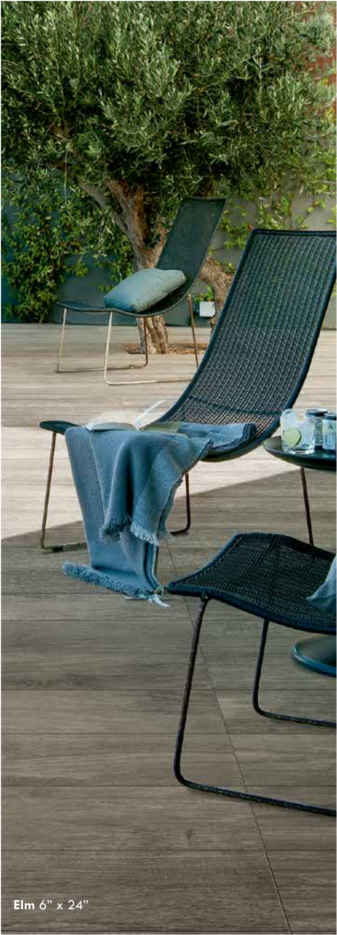
Elm 6" x 24"

C1028 COF Dry ≥ 0.80 Wet ≥ 0.60 Acutest COF Wet ≥ 0.42