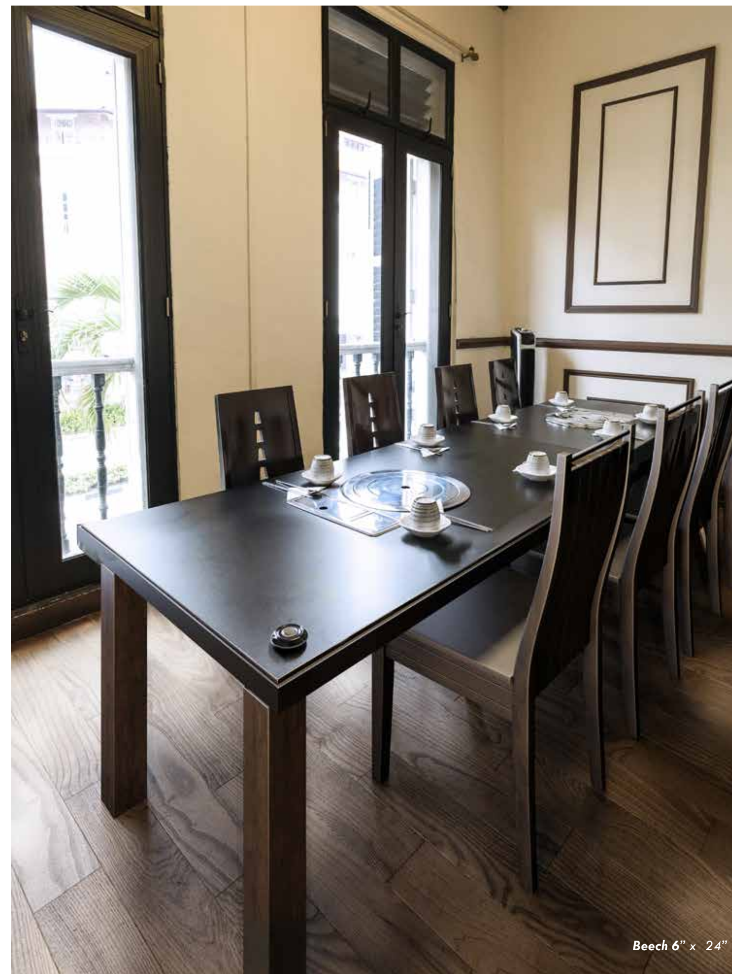
Beech 6" x 24"