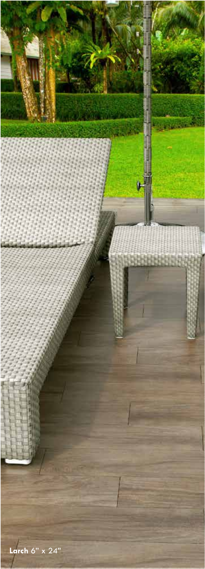
Larch 6" x 24"