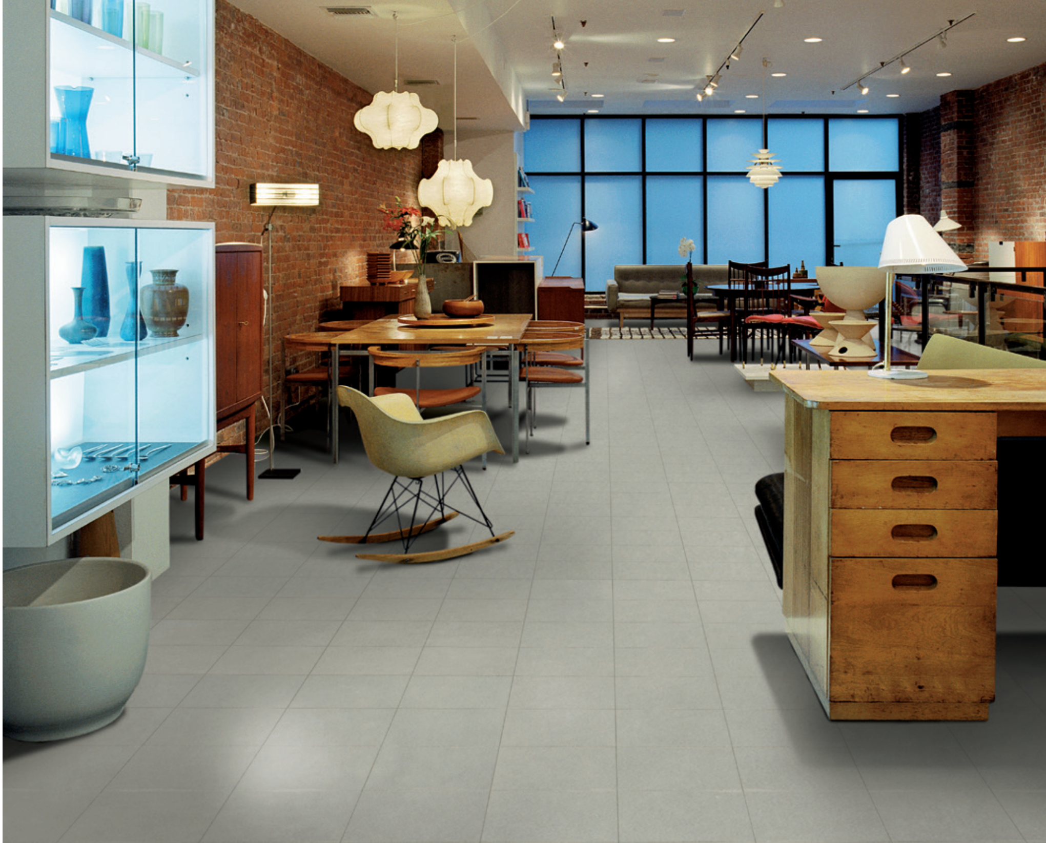
silver lake 12"x12"